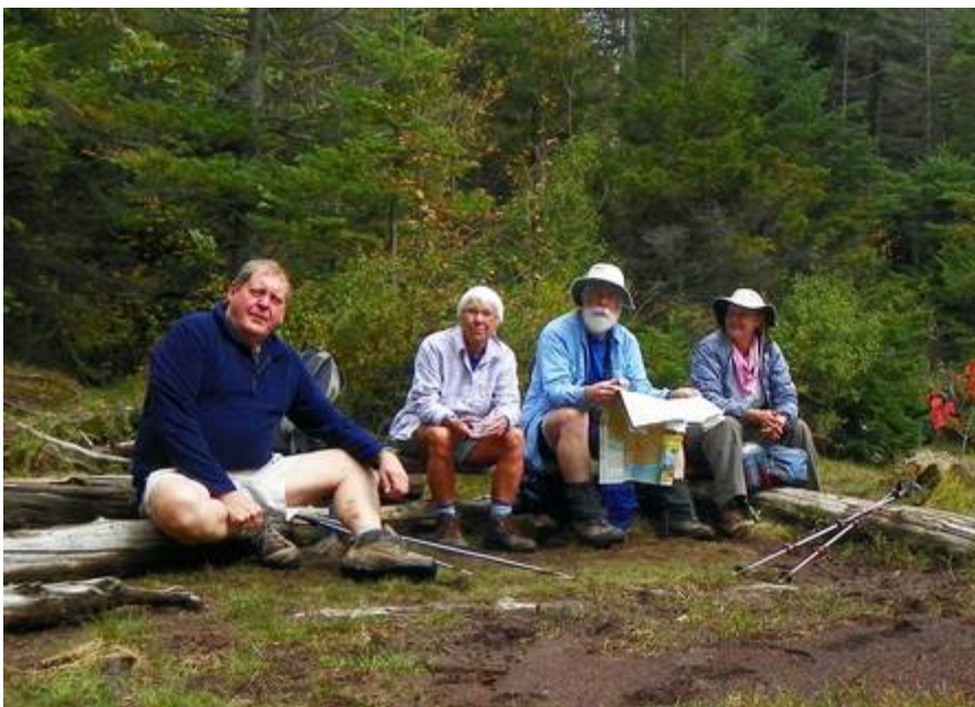
Taking a break or trying to figure out where they are?