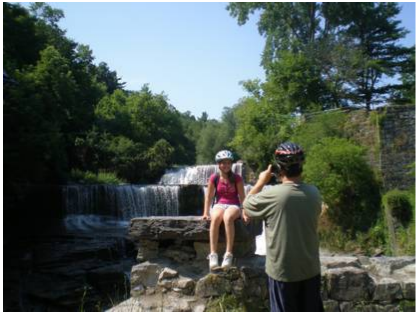
One of the stops along the trail.

July 14– Keuka Lake Outlet Trail bike ride. Six riders went from the downstream end of the Outlet Trail at Dresden to the source of the stream at Penn Yan, a distance of 7.5 miles. Many scenic stops along the way provide rest as we traversed up the slight incline. After lunch in Penn Yan it was a quick return on the down slope. Then we all stopped for a well deserved ice cream before heading back to Victor.