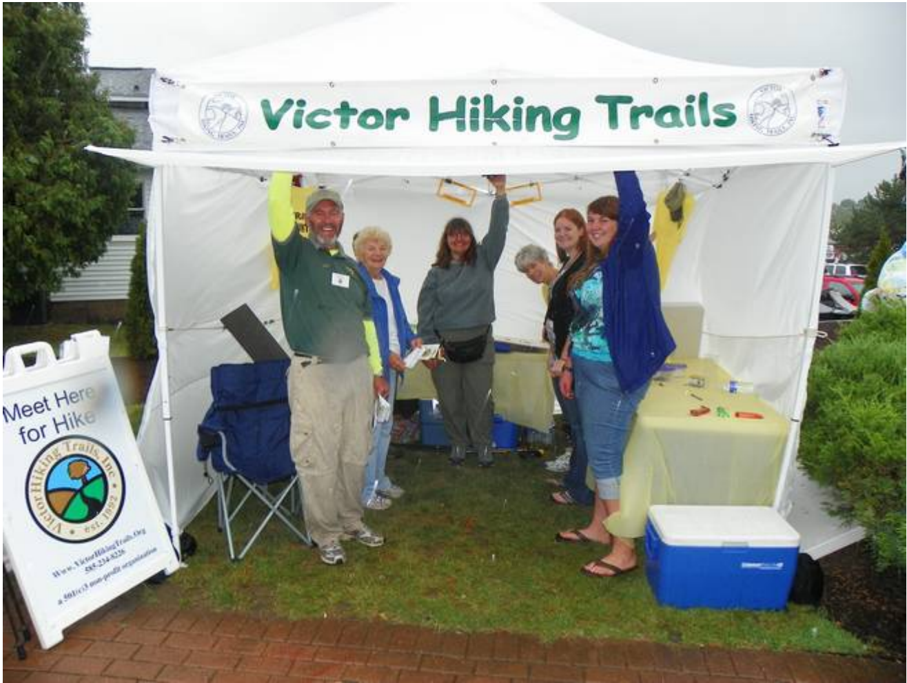
It got a little windy Saturday morning at HAVD when the cold front passed through. Hanging around VHT.