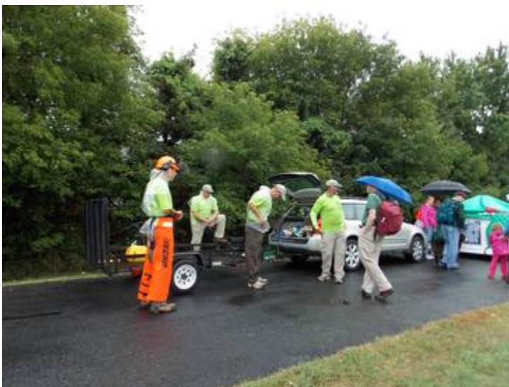
Getting ready for the Bicentennial Parade at HAVD.