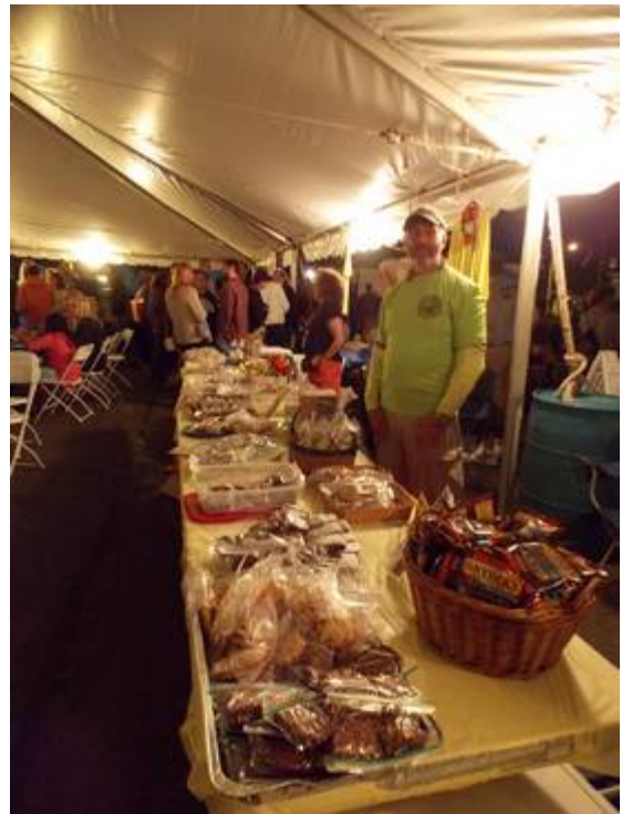
VHT dessert table at Victor Fest.